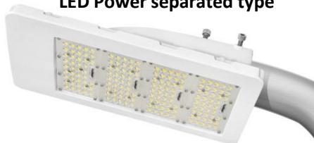
A-Type LED Power separated type